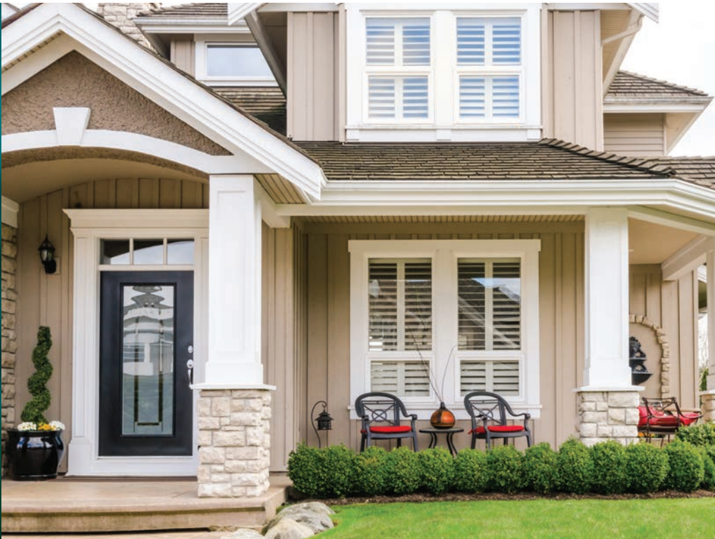
Color Shown: Sandstone

A beautiful collection of darker, richer colors with tremendous curb appeal, providing a real value for homeowners seeking a unique darker finish that stands out and stands apart from others in the neighborhood.